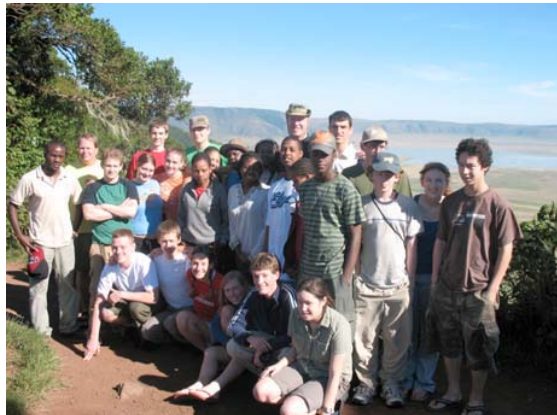
Global Technology Academy (GTA) team members from Seattle visited Ngorongoro Conservation Area during their stay in Tanzania.

A group of twenty-six (26) students and teachers from the Global Technology Academy (GTA) in Seattle, Washington departed Tanzania in April after maintaining two computer centers and outfitting six new ones in Arusha region: