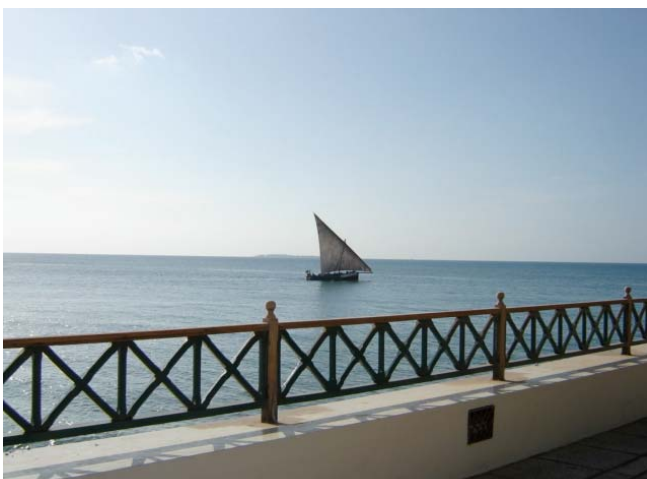
Terrawatu/Global Exchange Tanzanian Reality Tours now include a Swahili Coast segment to learn about Islam in Africa and conservation of marine resources.