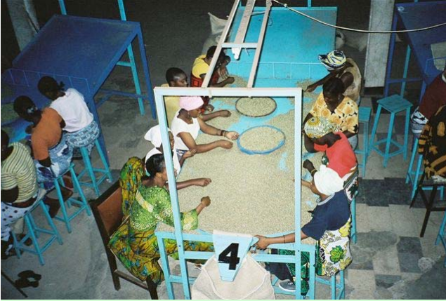
Coffee processing in Moshi, Tanzania.

Coffee central for north Tanzania is Moshi. Here is where the auction board is, many merchants, and processing facilities. Sululu knew of a large facility that would likely give me a tour, a first for me. I've spent exactly 7.9% of my awake life underground in wine cellars across Europe, but this would be the first time I'd see how coffee is processed on a large scale. Immediately the difference is one of hygiene and noise. It's dusty and loud! But the more important differences are of simple scale. In a large co-op, coffee is processed using very large, very expensive machines which grade, mill, and sort the coffee according to its quality. Then samples are sent out for auction buyers and other importers.