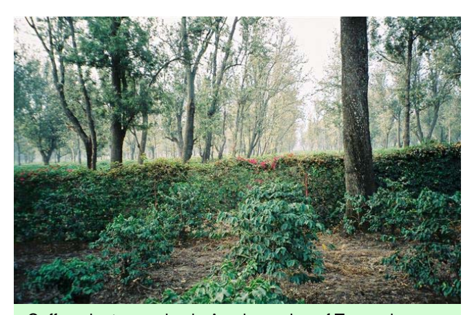
Coffee plants growing in Arusha region of Tanzania.

The necessity of going to Africa became thoroughly lodged in my every waking thought during the aftermath of Hurricane I relaxed in the glorious post-Wilma. hurricane weather, with no electricity or water, cooking on my camp stove, reading books and drinking wine. There was ample time for new revelations about many subjects to congeal and harden into a sharp, decisive point: It's time to experience Africa. Not to read about it, philosophize or It was time for me to move patronize. politically beyond spoon fed, correct assumptions about the continent and get the dirt under my fingernails. I had been dreaming for months the best way to get myself into the coffee business.