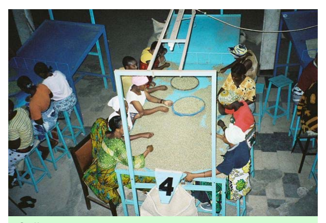
Coffee processing in Moshi, Tanzania.

Coffee central for north Tanzania is Moshi. Here is where the auction board is, many merchants, and processing facilities. Sululu knew of a large facility that would likely give me a tour, a first for me. I've spent exactly 7.9% of my awake life underground in wine cellars across Europe, but this would be the first time I'd see how coffee is processed on a large scale. Immediately the difference is one of hygiene and noise. It's dusty and loud! But the more important differences are of simple scale. In a large co-op, coffee is processed using very large, very expensive machines which grade, mill, and sort the coffee according to its quality. Then samples are sent out for auction buyers and other importers.