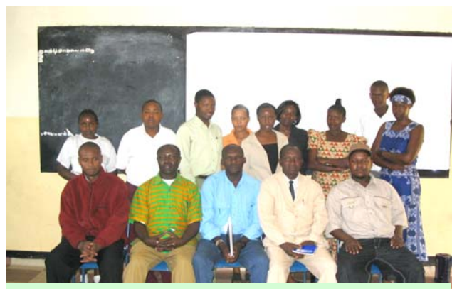
Tanzanian Team Partners from Ilkiding'a and Siwandeti Villages.

The twenty-two member team from Global Technology Academy (GTA) in Seattle, Washington, USA will be arriving in Arusha on 2 April with newly refurbished computers, keyboards, and other peripherals in their check-in luggage.