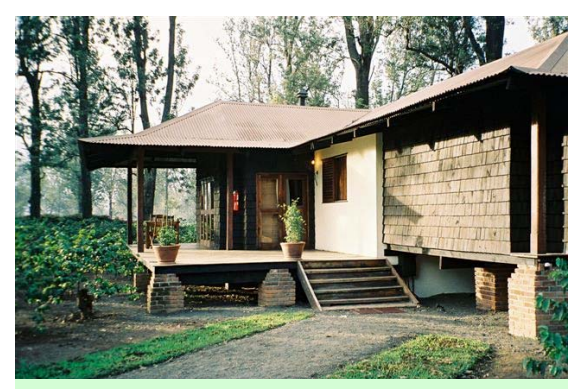
Room/small house at Arusha Coffee Lodge, just outside Arusha town.

After arriving at Kilimanjaro Airport and riding about an hour to my first lodging Tanya and Sululu went to the bar while I went to my "room", which in fact was my own small house. I had been greeted warmly and given a glass of delicious tomato juice (I would later eat tomatoes in Tanzania to rival even those in Italy). I was then guided along a gravel path to my lovely bungalow in the middle of a coffee plantation. I wouldn't see until morning how beautiful the setting was, but the house was delightful. I changed my shirt, and rushed back to the bar for my first Tanzanian beer and a planning chat with Tanya and Sululu.